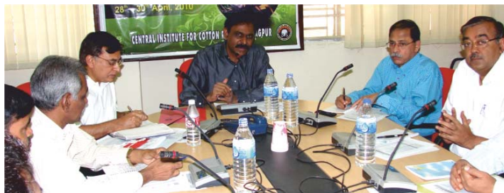
Director, CICR, Nagpur addressing Scientists at IRC meeting