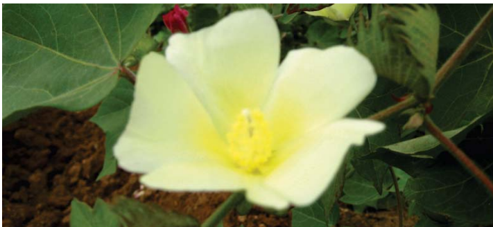
Culture CCH 2623 Single Plant and Flower