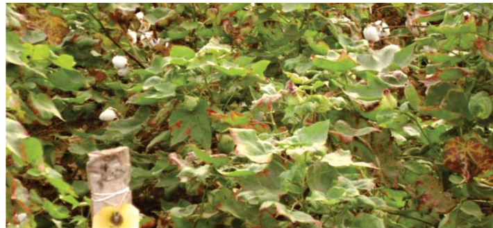
Triazophos induced "Hopper Burn" in Cotton

population of jassid Amrasca devastans Dist. Cicadellidae, Homoptera. Imidacloprid, Acetamiprid, Thiomethoxam and Acephate 95 % SG were effective against jassid and brought out a reduction of 45.0, 42.1, 38.2 and 38.2% over control while, Dimethoate and Triazophos recorded 7.7 and 20.0 % higher population. The plants treated with Triazophos exhibited a clear distinct symptom of "hopper burns" on the leaves.