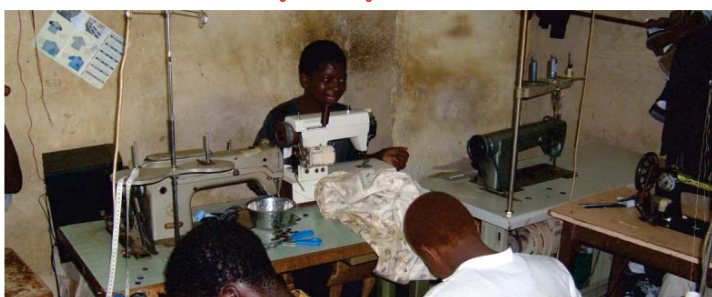
A small scale garment processing Unit