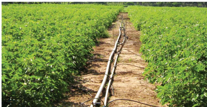
Herbigation for Weed management in cotton