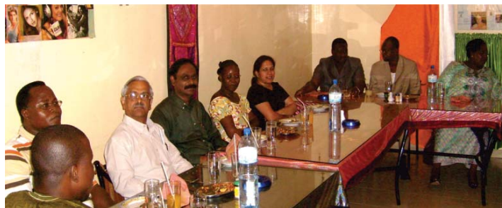
Indian Delegation at Indian restaurant in Burkina Faso