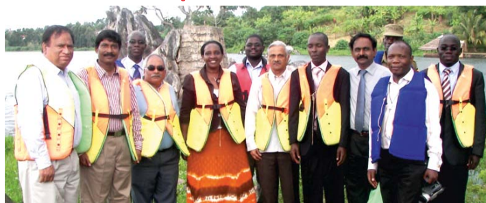
Delegation at Source of river Nile In Uganda