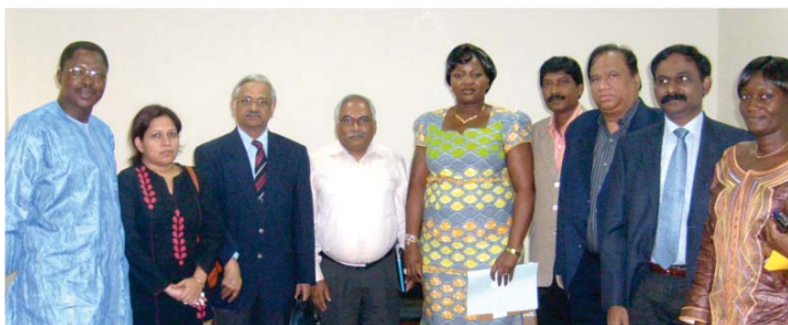
The Indian Delegation with dignitaries from C-4 Countries

During the visit, the delegation witnessed changes taking place in Africa from Bamako, fastest growing city in Africa to Kampala, the city of Seven Hills, all the places visited were full of activity, energy, liveliness and people working hard on farms and factories to improve their lives.