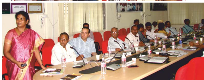
Director and Scientists presenting significant Research Achievements at TMC Annual Review Workshop