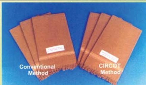
Towels processed in Mill